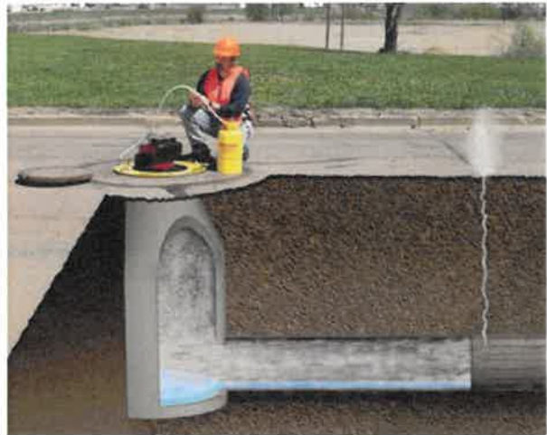
1: Smoke Testing (photo for informational purposes only)